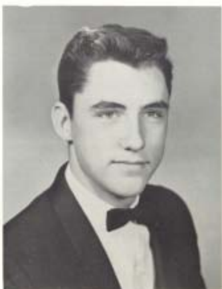
J. B. CLARK "Life is itself but a game of foot- ball."